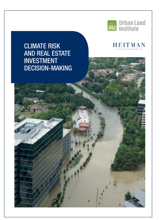
Climate Risk and Real Estate Investment Decision-Making, published in 2019, was ULI and Heitman's first joint research project on this topic.