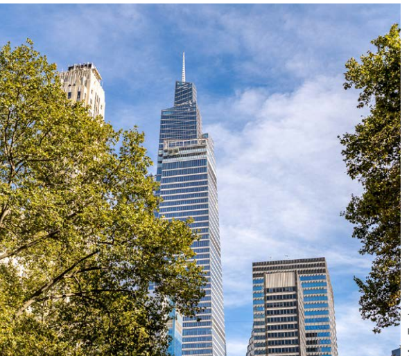
SL Green's One Vanderbilt in New York City.

Real estate firms align with the SDGs in many ways; however, several goals are most commonly cited. ULI Greenprint real estate members most frequently align with Climate Action (13); followed by Industry, Innovation, and Infrastructure (9); and Responsible Consumption and Production (12). The following pages show example language from public real estate ESG reports, in alignment with specific SDGs. For more details on how real estate aligns with the SDGs, links to company websites or sustainability reports are provided for each example.