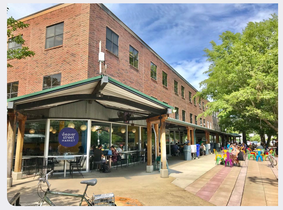
Weaver Street Market is a co-op, owned by its members and employees. This model has created strong community bonds and ensured access to high-quality food for all.

Weaver Street Market in Carrboro, North Carolina, is an employeeand shopper-owned co-op grocery that is committed to being "a market for the community, by the community."<sup>26</sup> Offering natural,