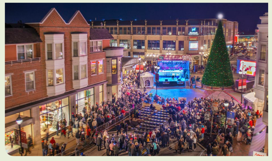
Crocker Park has been called a "city within the city" of Westlake, Ohio. It caters to the community's everyday needs and brings people together for various celebrations, including the yearly tree lighting during the holiday season.

Cleveland-based developer Stark Enterprises opened the first phase of Crocker Park in 2004. The "city within a city" includes 534 rental apartments above ground-floor outdoor-facing retail space that includes over 2 million square feet of retail space occupied by more than 140 retail and restaurant businesses. Stark Enterprises strongly values supporting local entrepreneurs, and Crocker Park