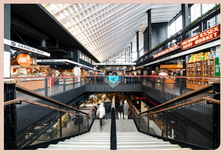
Essex Crossing in New York City, a public/private partnership, has worked with the community to identify necessary amenities, including local-cost groceries, fresh food, and varied retail options.

The e-commerce boom and other recent trends are not death knells for brick-and-mortar retail but rather an invitation for retail owners to provide enhanced experience to build a customer base and build community.