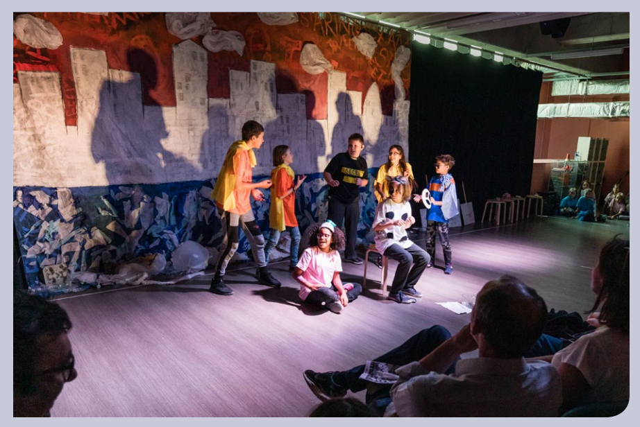
Creating inclusive and flexible gathering spaces allows for creativity, connectivity, and exploration. The Yellow, Wembley Park's community hub in London, welcomes people of all ages to engage with one another.

Investment in privately owned third places not only benefits the community members who use the spaces but also benefits the owners. Thriving commercial environments, where people shop, mingle, and consistently return, are indicative of financial success and stability for property and business owners alike.