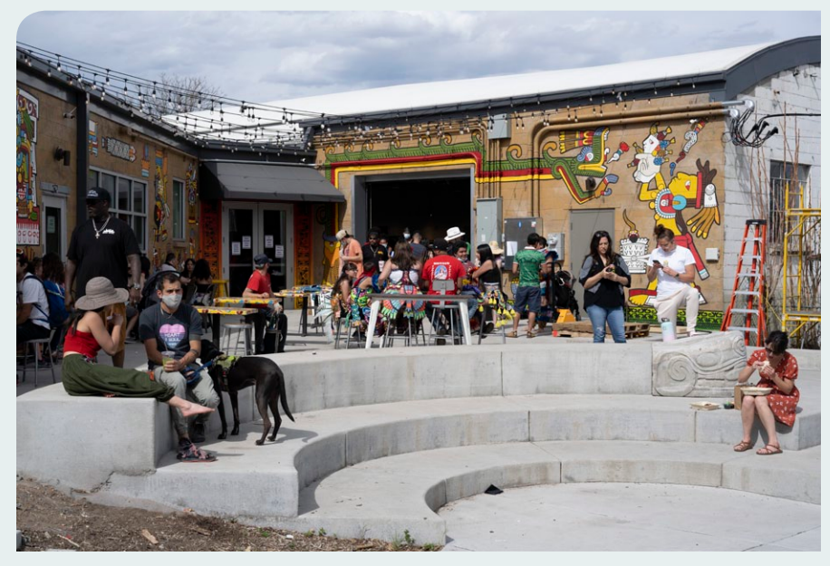
Hecho en Westwood Collective serves as a community hub, where residents come together to celebrate their communalities and differences.

Benefits to small business owners who are part of this type of a collaborative are many; each business helps promote the other businesses within the space, and they can collaborate to create culturally relevant events that engage community members. While the businesses in the collective are largely food-based businesses, they work with other local organizations to bring in dance, art, and music to these events to help make community residents feel welcomed to the space. With businesses that respond to the local community cultures, such as the ones in the Hecho en Westwood Collective, there is also an economy of scale when sourcing cultural products that can be shared among businesses.