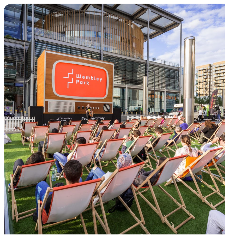
(Wembley Park and Quintain)