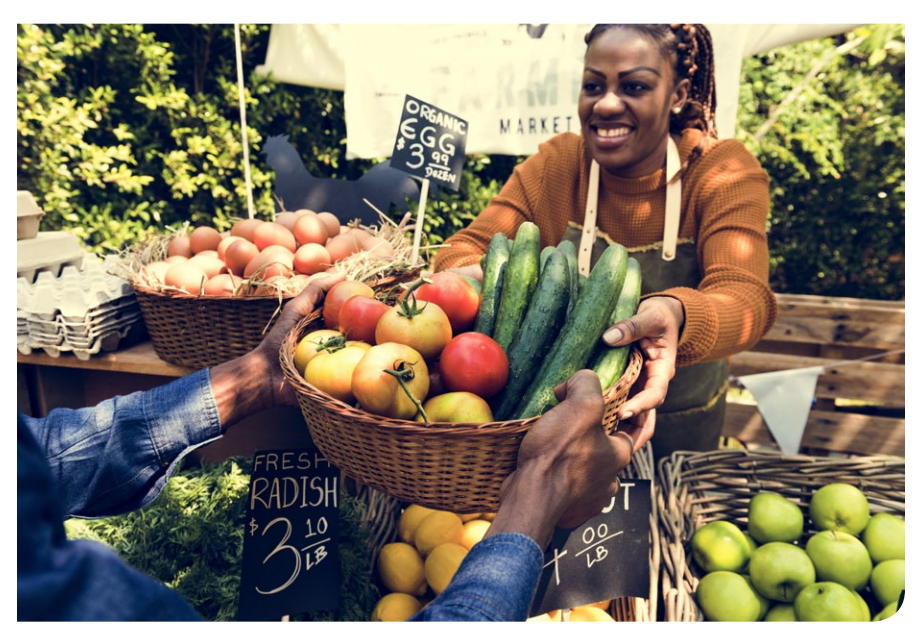
Providing programming that meets community needs, such as a farmers market selling fresh produce, can aid in supporting social connections and community resilience.

Listening to community members and creating spaces that meet their needs—in terms of desired businesses as well as engaging programs and activities—can serve to bring more people to these third places, thereby increasing the social connections in the community and potentially retail sales in the development. The following strategies outline specific methods to help engage the community.