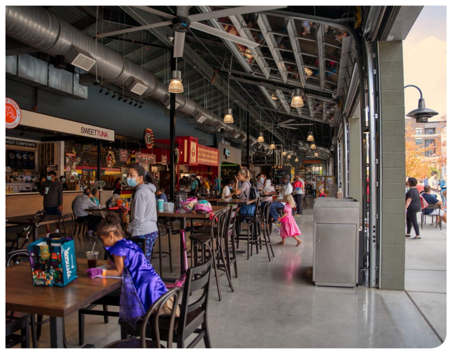
The Halcyon Village retail development in Alpharetta, Georgia, encompasses both national brands and local stores. The smaller footprint of several of the local businesses allows sharing of resources within the same facility and reductions in overhead costs.

Recruiting tenants that respond to surrounding community needs can help ensure that the businesses succeed, potentially reducing risks to and increasing returns for the property owner. Communityfocused developments have shown lower vacancies and higher retail revenues compared to regional malls.<sup>38</sup> Specifically supporting Black, Indigenous, people of color (BIPOC) and women community members—as business owners and employees—can also help close the wealth gap and promote more equitable outcomes.