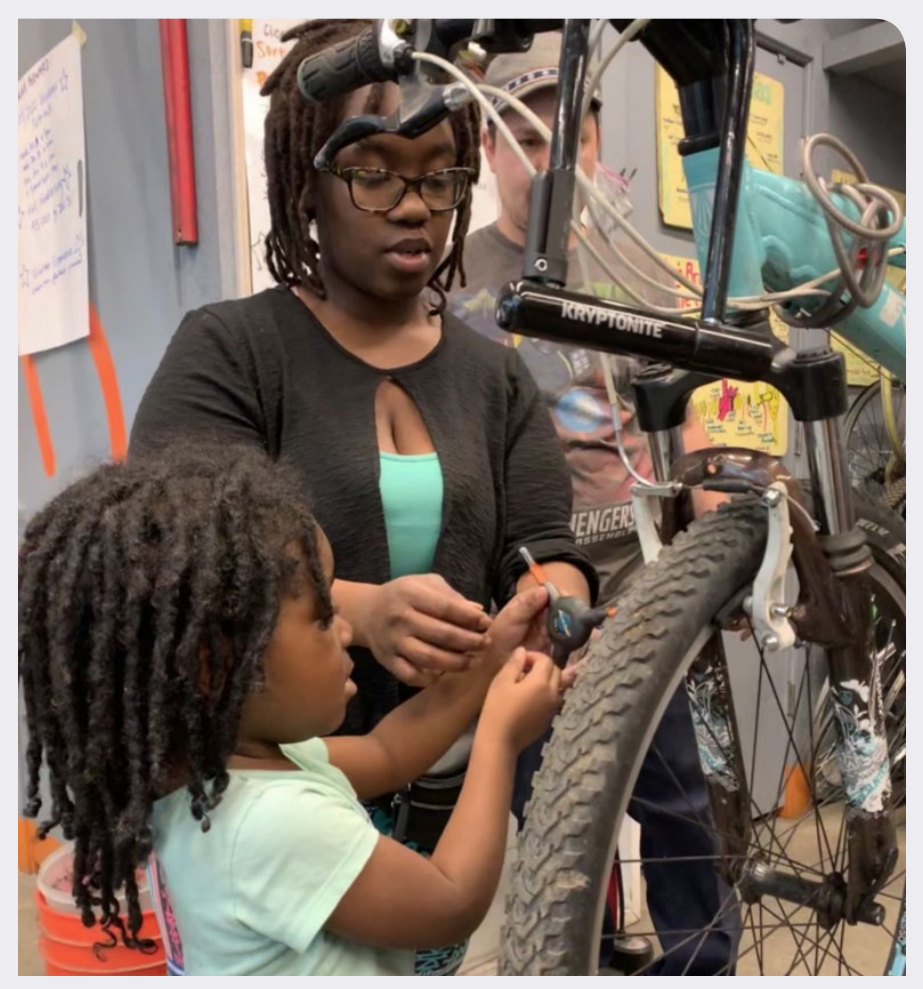
Bikes Together provides training courses to Fix-Your-Bike participants who gain skills and knowledge on how to use and maintain a bike, helping reduce historic disparities and provide equitable access to bicycles as a form of active transportation.

To provide equitable access to bicycles and bike education, Bikes Together sells refurbished bicycles at various price points and opens its repair workshop to community members of all experience levels—staff and volunteer mechanics are available to help identify replacement parts and make the repairs. Based on the parts used for the repairs, staff offers a suggested price and the community member can pay what is affordable. This Fix-Your-Bike program ensures equitable access to bike repair, and it helps empower bike owners to learn to care for and maintain their bikes; on average,