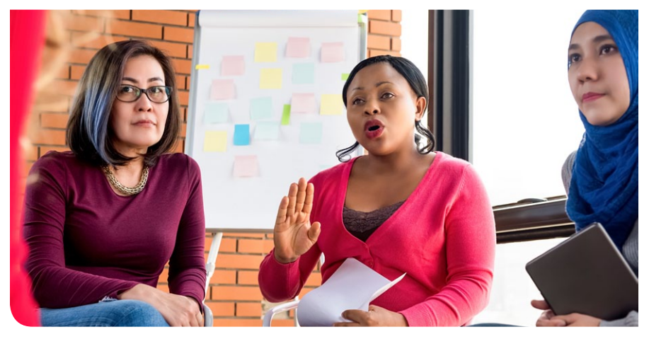
Community support is vital to a development's success. By prioritizing community engagement processes and asking community members key questions, developers can identify business gaps and opportunities to serve the surrounding neighborhood, garnering buy-in from residents.

Often these processes are required by cities to get project approval, but going the extra mile to engage community members