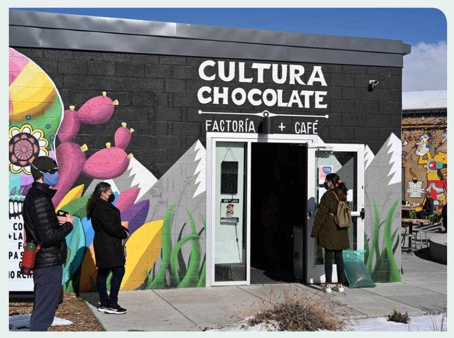
Cultura Chocolate houses the Hecho en Westwood Collective in Denver. This collection of Latinx, BIPOC, and women-owned small businesses work together to preserve and grow the local economy and cultural identity. (Christina N. Contreras)

A locally owned small business itself, Cultura Chocolate has offered space to a number of other local food businesses as part of the Hecho en Westwood Collective, including Honduran food venture Xatrucho, Latino coffee business Cabrona Coffee, vegan and gluten-free bakery Just Indulgence, and Mayan and Yucatan food truck X'Tabai (pronounced ish·ta·bī) Yucateco. The business owners see the collective as an important part of the Westwood community's efforts to prevent gentrification and displacement and to support community self-determination.