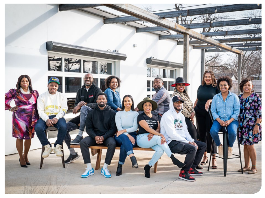
EastPoint in Oklahoma City is an example of how to co-invest with tenants. In this project, tenants build out their own space. Once the lease is signed, they receive 15 percent ownership of their space, which they can grow and hold until they choose to sell it.

Other synergistic arrangements involve contributions of cash equity from project tenants. This strategy helps ensure that tenants are as committed to the success of the building and space as the owners and manager.