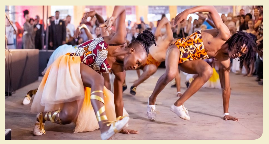
Victoria Yards established the Makers Valley Partnership as part of the redevelopment of the site in Johannesburg, South Africa, to fortify relationships with the community beyond the potential workforce. Community members were integral to determining the best use of the space.

of a new project, can help developers understand not only what types of events are of interest but also what new businesses or other commercial uses might be needed in the community.