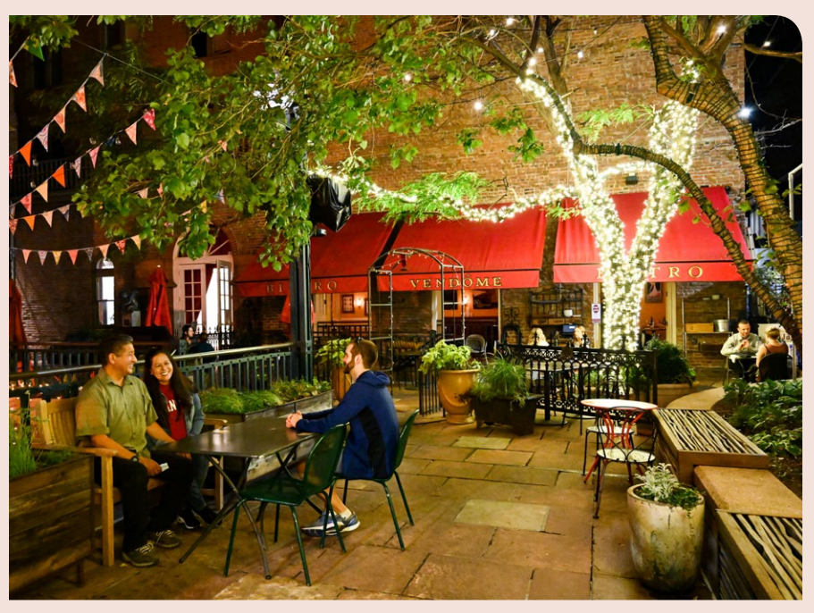
(Christina N. Contreras)

Third places—coffee shops, parks and plazas, stores, and more can provide opportunities for vital community connection, healthpromoting activities, and civic engagement. In third places, people exchange ideas, have a good time, and build relationships. A vibrant network of third places is essential for civil society, democracy, and civic engagement to thrive, and for people to feel a sense of belonging and connection to other people and their community. These types of places can be publicly or privately owned and operated, but they are all publicly accessible spaces that welcome everyone.