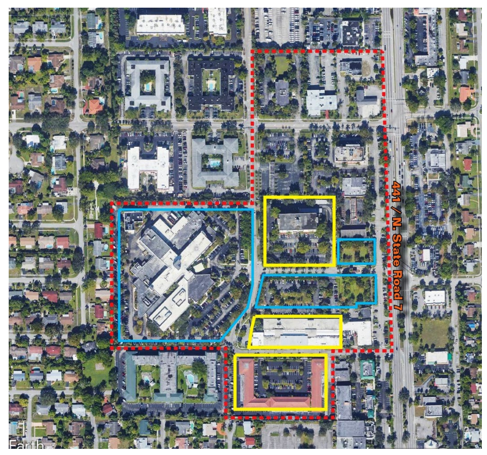
Image 2. Study Area Boundary (Blue: HCA-owned properties; Yellow: adjacent Medical Office Buildings)