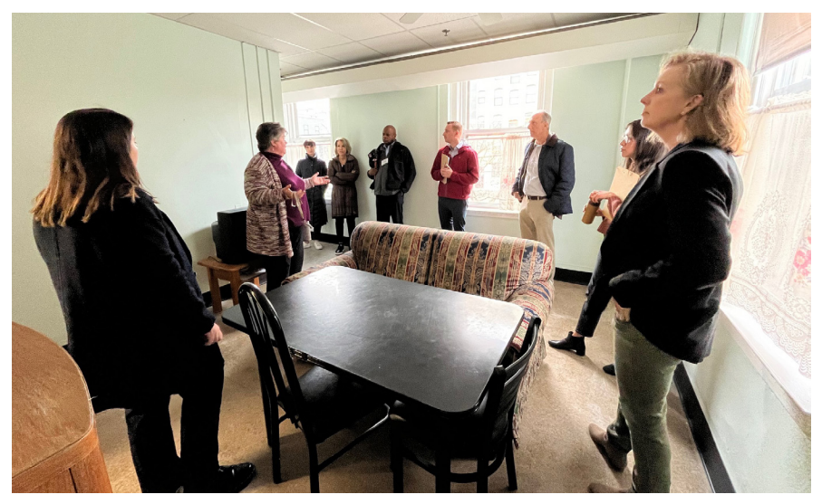
Members of the ULI Philadelphia project team tour the Drueding Center.

Families Forward Philadelphia TAP Report