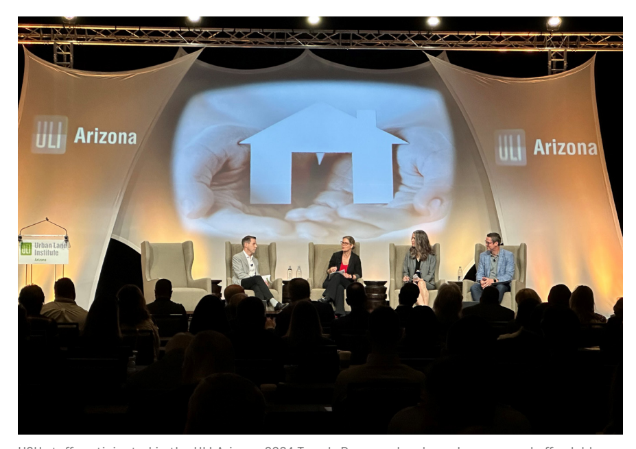
H2H staff participated in the ULI Arizona 2024 Trends Day panel on homelessness and affordable housing.