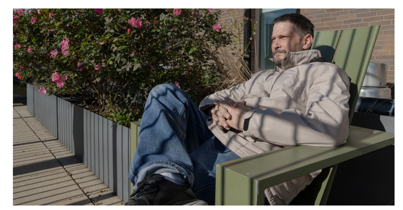
A resident seated in the garden at the Landing Road Residence in the Bronx, New York. A LOOK AHEAD 18

In phase two, we will take the next step, moving from raising awareness to taking action. We'll continue to educate and inform our members but with an added motivation: connecting them directly with service providers and housing experts. Through new strategic partnerships and alliances, we will define the role of commercial real estate and finance to address the housing and homelessness crisis in the U.S. We will also seek to mobilize ULI members to accelerate the delivery of more deeply affordable housing connected to meaningful, supportive services, bringing us closer to our goal—ending homelessness and ensuring everyone has a safe and secure place to call home.