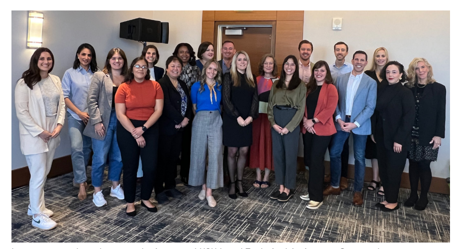
Lessons were shared among the inaugural H2H Local Technical Assistance Grant cohort teams, including ULI Louisiana, ULI Philadelphia, ULI San Antonio, ULI San Diego-Tijuana, and ULI San Francisco.

From July 1, 2023, to June 30, 2024, ULI district councils working in Lafayette, Louisiana; Philadelphia, Pennsylvania; San Antonio, Texas; San Diego, California; and San José, California, received financial and staff support to advance local scopes of work. H2H distributed $90,000 across the five district councils. Teams augmented local grants collectively with an additional $450,000—a significant portion of which was in-kind professional services. This combination of cash and in-kind services increased the total program impact to $540,000, representing a 500 percent return on investment. In other words, every dollar H2H provided to local communities achieved four dollars' worth of results or benefits.