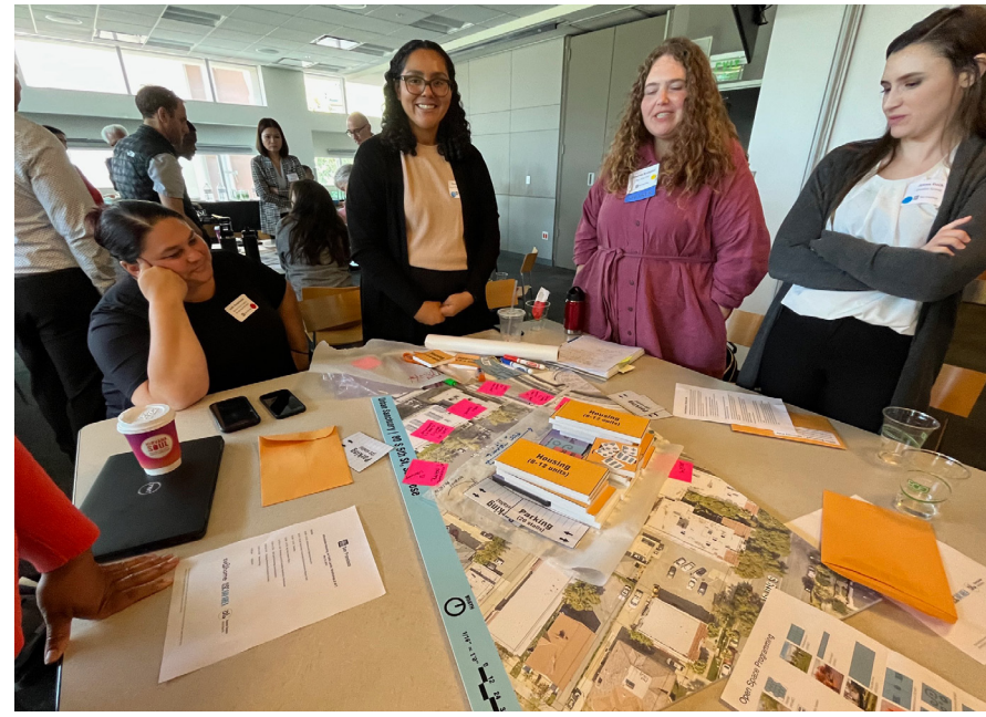
ULI SF convened San José community members for an "Affordable Housing on Faith Lands" workshop series.