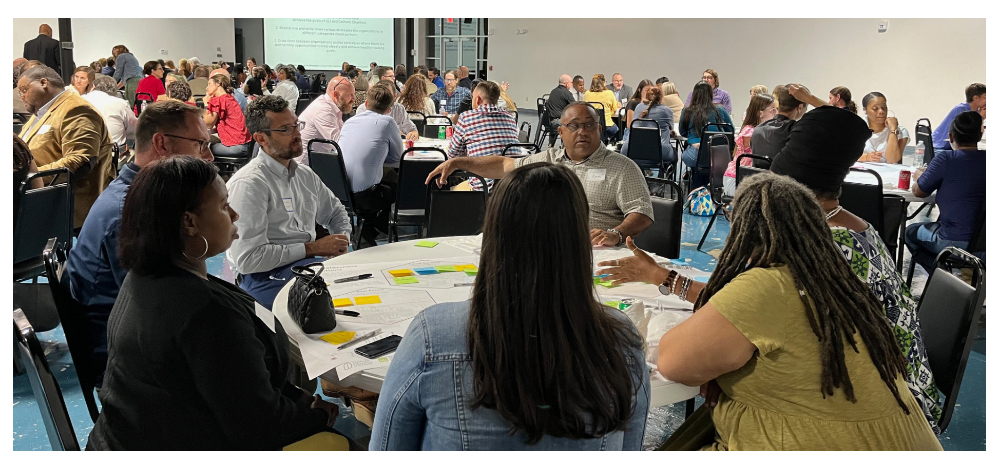
Concordia, a New Orleans-based architecture and urban planning firm, led community engagement sessions to inform the housing-based solutions for Lafayette, Louisiana.