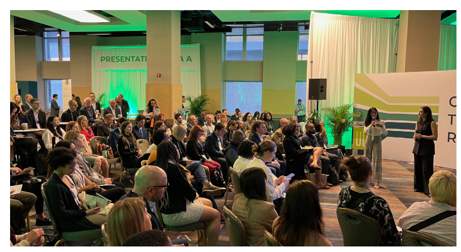
At the 2024 ULI Spring Meeting in New York City, H2H staff shared a model to bridge a critical gap in the Continuum of Care while optimizing development costs and unleashing the potential underused land for interim community benefit.