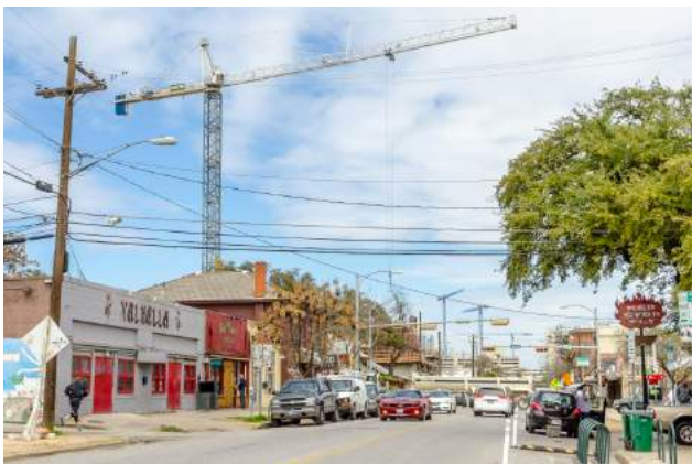
Figure: Construction cranes hovering above Red River

Venues especially need to find ways to reduce costs in the spring because landlords often add a surcharge in March, sometimes even doubling the rent for that month due to the venue's increased income from SXSW. One club manager said that the annual festival is responsible for 30 to 50% of the club's annual revenue, noting the potential disastrous shortfall if some unforeseen impact caused decreased attendance. Current policy that helps enhance bar sales during SXSW, like the current sound extensions until 2:00 a.m. during SXSW Interactive & Music, should be protected, while additional policy, permitting or compliance additions for the Spring Festival should undergo stakeholder review and analysis of any negative impact.