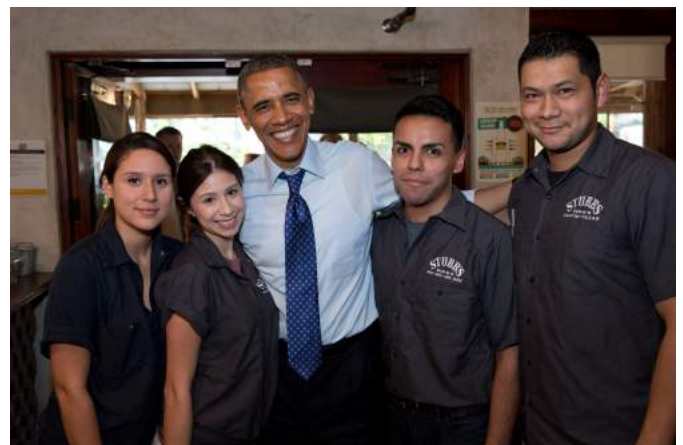
Figure: Former President Obama at Stubbs BBQ on Red River.