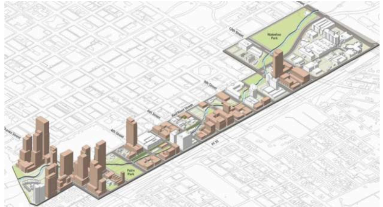
Figure: Rendering of Red River Historical District

A 2016 Austin Music People (AMP) study reveals that the music industry's share of that economic impact rose from $1.6 billion to $1.8 billion from 2010 to 2014. More recent figures peg the music industry's impact at $2.4 billion. AMP attributes that growth to festival expansion, including the addition of a second weekend to the Austin City Limits Festival and the opening of the Austin 360 Amphitheater at Circuit of the Americas. The same study, however, indicates that year-round economic activity by local artists, venues, and businesses suffered a 15% loss in the same four-year period, representing a decrease from $856 million to $726 million and a loss of 1,200 local music industry jobs. A number of beloved music venues have also been lost. As Austin Mayor Steve Adler implores, "We cannot lose these music venues without losing something that is vital to our identity and to our soul."