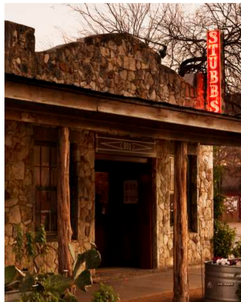
Figure: Front of Stubbs BBQ & Live Music.

Some 62% of venue operators confirmed that inconsistent information and enforcement from APD regarding sound ordinances has an extreme, strong, or moderate impact on their business. A majority of venue operators, however, expressed the understanding that many of these problems are unintentional and likely due to an institutional inability to keep pace with Austin's rapid growth.