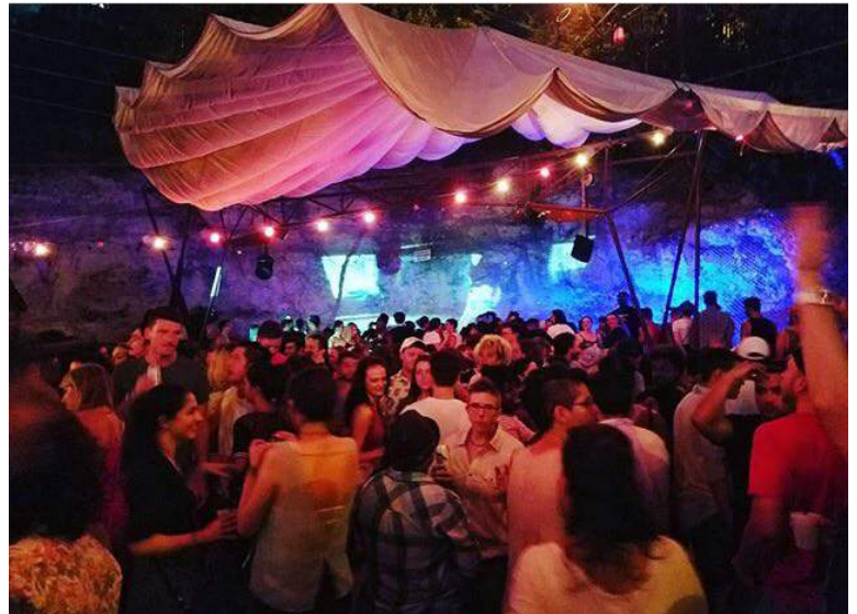
Figure

A major strength of the program is ULI's unique ability to draw on the knowledge and expertise of its members, including land developers and owners, public officials, academicians, representatives of financial institutions, and others. In fulfillment of the mission of the Urban Land Institute, this Technical Assistance Panel report is intended to provide objective advice that will promote the responsible use of land to enhance the environment.