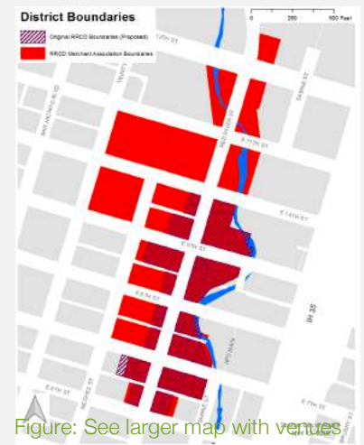
Figure: See larger map with venues in Addendum A.

The following report provides greater detail for these findings and a more comprehensive listing of all recommendations (pages 16-18).