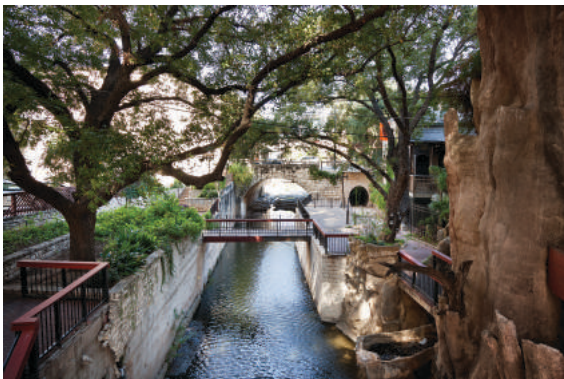
Figure: Stock photo, view of Waller Creek

Additionally, improvements currently underway by the Waller Creek Conservancy will impact the district positively in a number of ways. At least two District venues, Stubbs and Empire, have been hampered in the ability to make needed