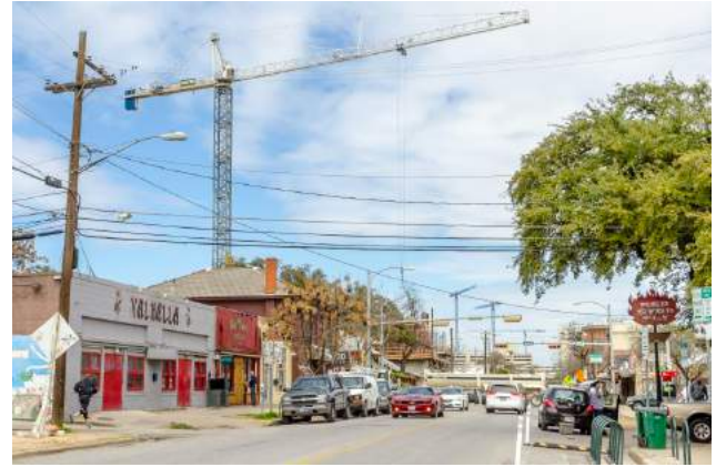
Figure: Construction cranes hovering above Red River

More than 80% of the 3,968 Census respondents agreed that stagnating pay for musicians has an "extreme or strong impact" on musicians' ability to earn a viable income and remain in Austin. Of the 1,882 musicians completing the survey, nearly one third cited an annual gross income of $15,000 or less, and approximately three quarters of the musicians earn less than the Austin Mean Annual