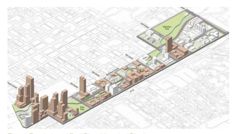
Figure: Rendering of Red River Historical District

A 2016 Austin Music People (AMP) study reveals that the music industry's share of that economic impact rose from $1.6 billion to $1.8 billion from 2010 to 2014. More recent figures peg the music industry's impact at $2.4 billion. AMP attributes that growth to festival expansion, including the addition of a second weekend to the Austin City Limits Festival and the opening of the Austin 360 Amphitheater at Circuit of the Americas. The same study, however, indicates that year-round economic activity by local artists, venues, and businesses suffered a 15% loss in the same four-year period, representing a decrease from $856 million to $726 million and a loss of 1,200 local music industry jobs. A number of beloved music venues have also been lost. As Austin Mayor Steve Adler implores, "We cannot lose these music venues without losing something that is vital to our identity and to our soul."