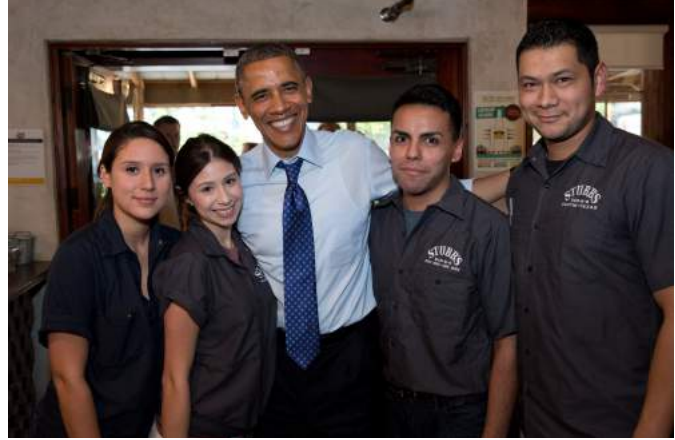
Figure: Former President Obama at Stubbs BBQ on Red River.