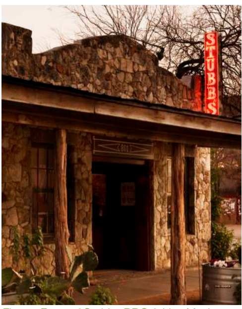
Figure: Front of Stubbs BBQ & Live Music.

Additionally, the Census found that the changing trends in Austin music consumer behavior include reluctance or unwillingness to pay a typical $5 to $10 cover charge. Thus, cover charges have remained stagnant, declined compared to a decade ago, or disappeared entirely. As a result, some venues report an annual revenue loss as high as 30%, and local bands especially have seen their performance income diminished.