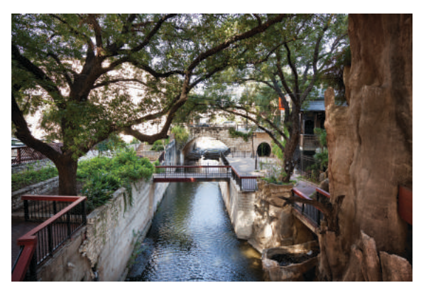
Figure: Stock photo, view of Waller Creek

Additionally, improvements currently underway by the Waller Creek Conservancy will impact the district positively in a number of ways. At least two District venues, Stubbs and Empire, have been hampered in the ability to make needed