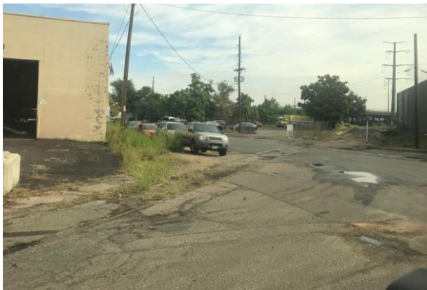
Quigg Newton Homes has issues with poor infrastructure and a lack of connectivity with the surrounding community.