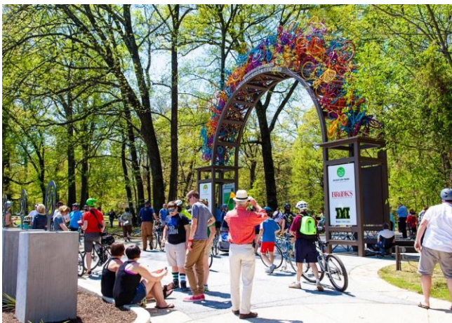
Example of a pedestrian/bike gateway. Largely funded by foundations, this new gateway and plaza in Overton Park, Memphis, links to downtown and neighborhoods through bike lanes and trails. It has been called a love letter to Memphis cyclists.