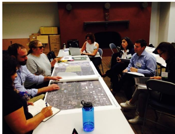
ULI volunteers speak with local stakeholders during the workshop.