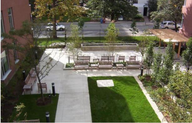
Panelists suggested integrating green space in and around the proposed buildings.