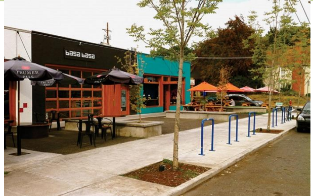
Panelists suggested creating a Main Street feel along W. 44 th Avenue, especially with a mix of uses between Navajo and Jason Streets. A fitting example of how this could work is South Pearl Street in Denver between Jewell and Butchtel.

Red areas highlighted on the map along 44 th between Navajo Street and Jason Street are opportunities to activate the street with ground-level retail or other neighborhood serving amenities. The pedestrian and bike experience could extend along Jason Street for transit goers coming to and from the 41 st and Fox Station.