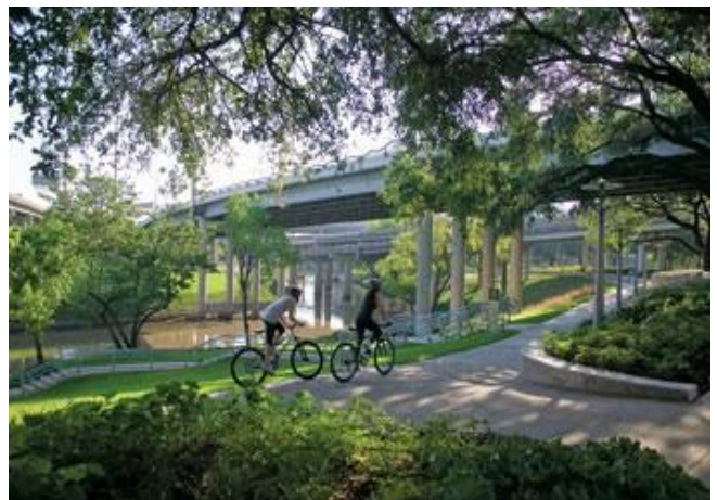
Houston's Buffalo Bayou trails provide alternatives for active transportation in this freeway-laced city. Good for neighborhood services and business, too: A 2013 study of these urban trails showed a fourfold increase in the number of businesses in the area and boosted retail sales from $10 million to $57 million.

Colorado District Council of the Urban Land Institute (ULI Colorado) 1536 Wynkoop Street, Suite 211, Denver, Colorado 80202 303.893.1760 Colorado@uli.org Colorado.uli.org