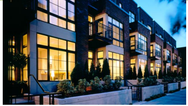
Panelists suggested adding a mix of housing types and densities to the Quigg Newton site, including townhomes.

The panelists responded: diversify and increase housing options for individuals and families on the Quigg Newton site. They agreed that DHA has a significant opportunity to realize this vision on such a large and high value site.