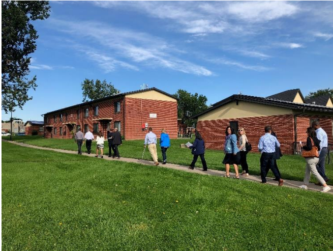
ULI volunteers walk with DHA staff and City Councilman Espinoza through the Quigg Newton Homes during the workshop.