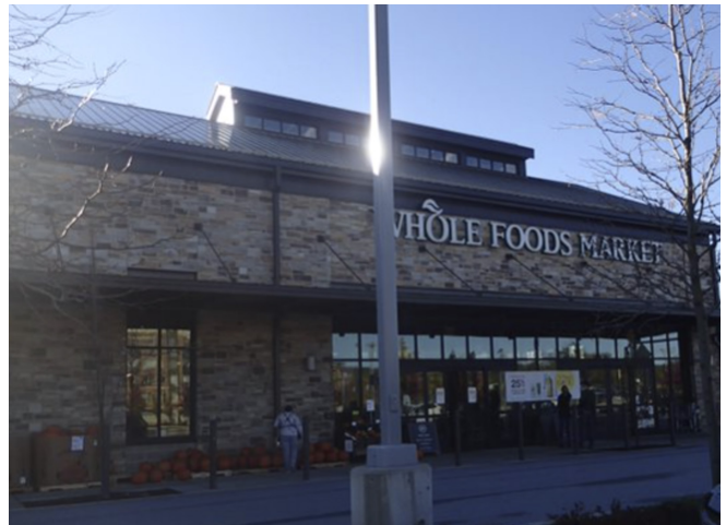
Both: While The Crossroads already features attractive retail offerings, improved coordination could enhance the retail mix further.