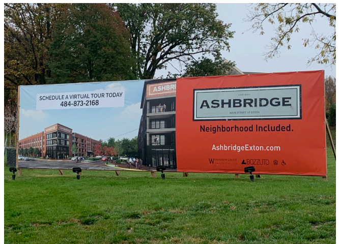
New apartment units offer diverse housing options and new density that could support commercial activity.