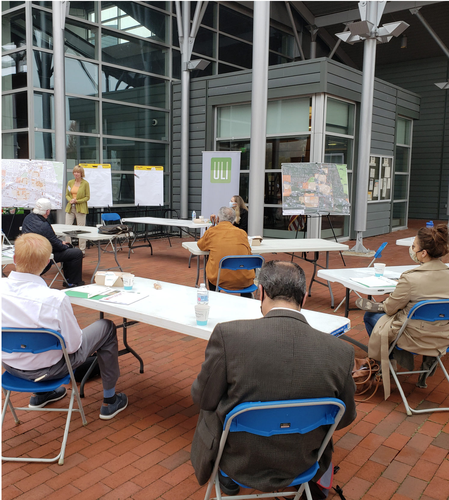
Panelists hear from sponsor during socially distance briefing.