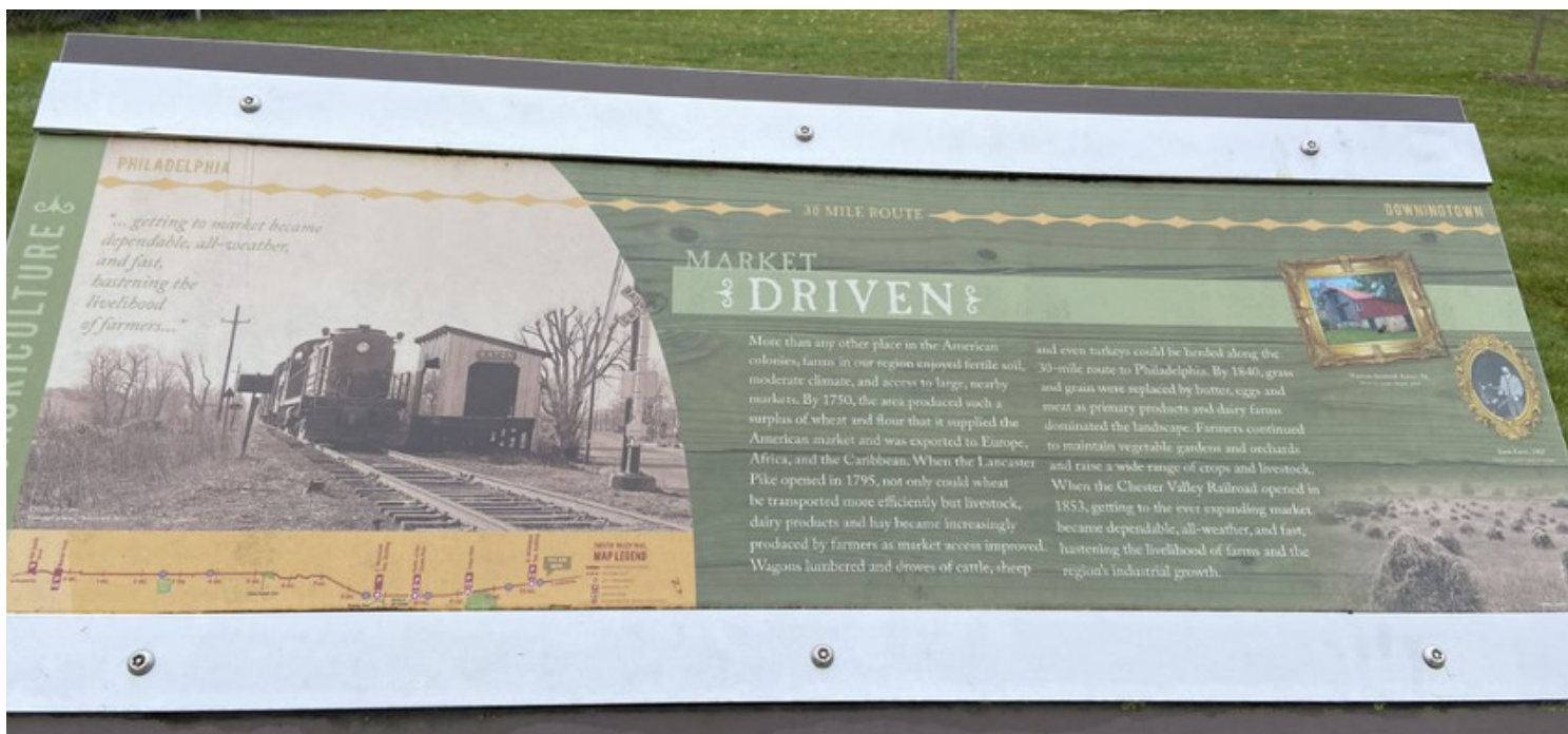
Signage illustrates the area’s commercial history.

Miller Park in the northwest quadrant is widely considered a popular asset but is only accessible to the residential community, as it is blocked by the back of Whiteland Towne Center. Consider creating a route from the shopping center to the park and opening the wall of stores to allow easy flow from the neighborhood into the retail center with added outdoor seating and amenities.