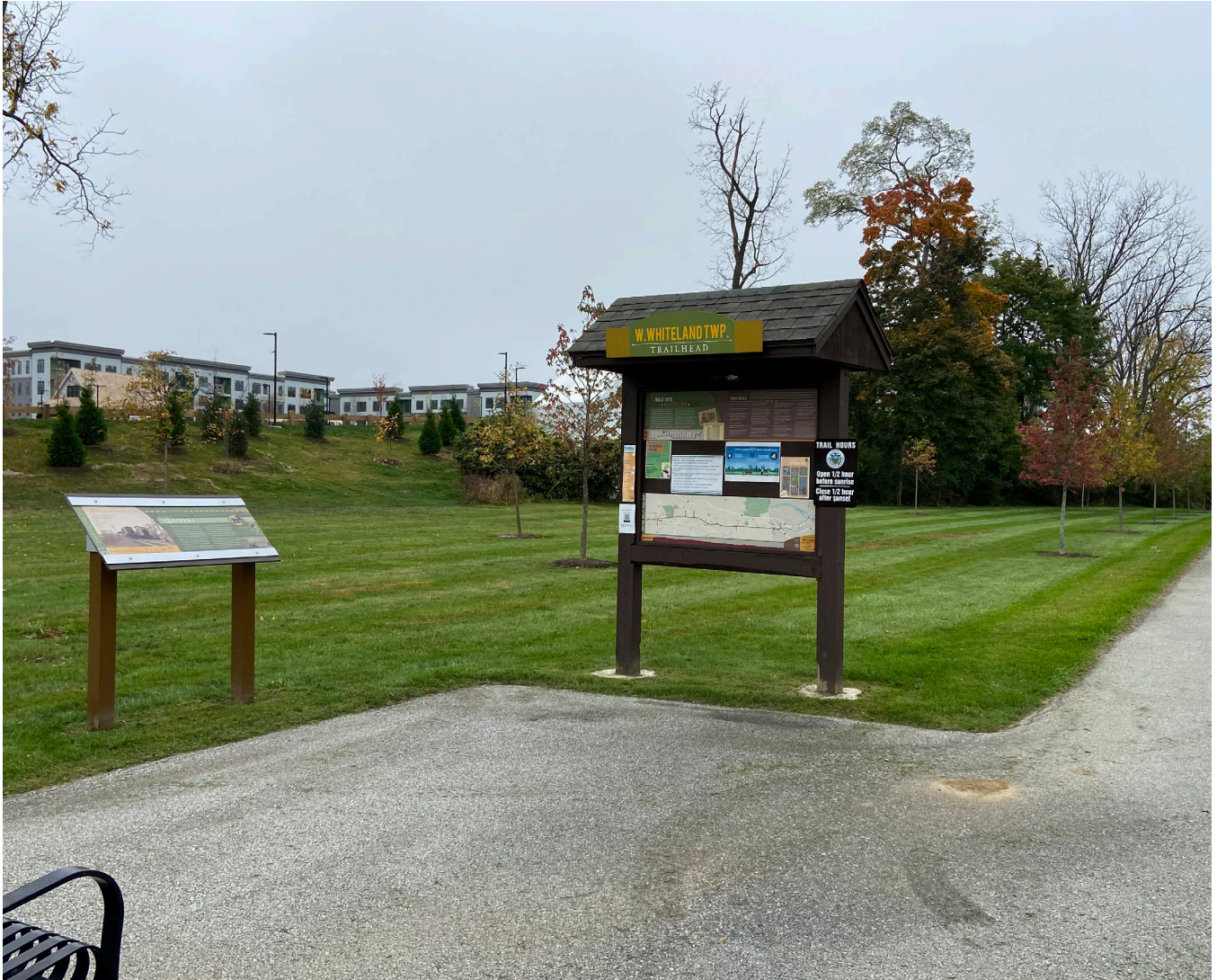
Access to Chester Valley Trail near Main Street at Exton.