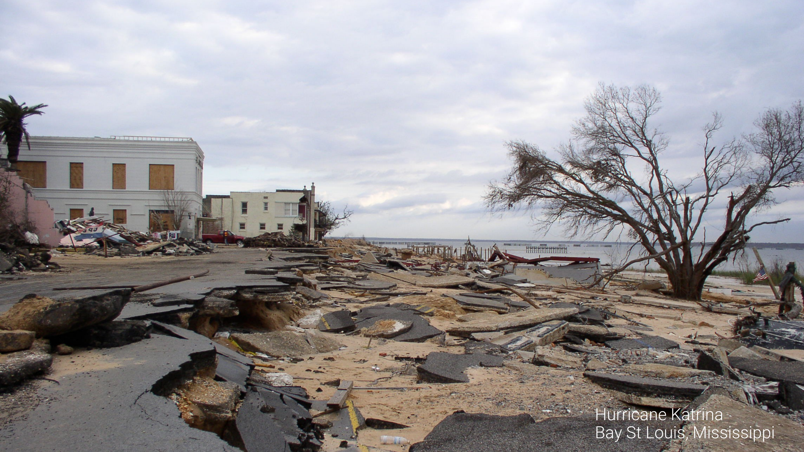
Hurricane Katrina Bay St Louis, Mississippi